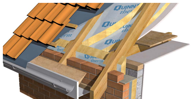
Pitched roof: QL-Kraft below rafters