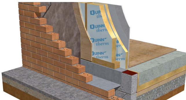
Cavity walls: QL-Kraft in timber frame