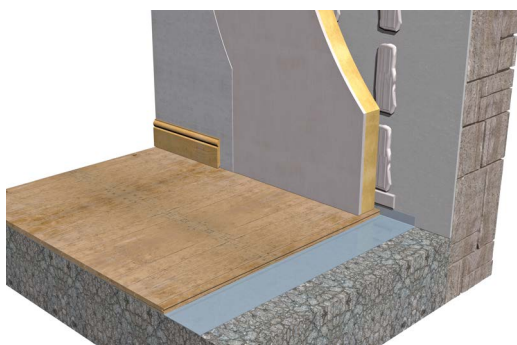
Solid walls: internal dry lining QL-Kraft fixed to plaster dabs