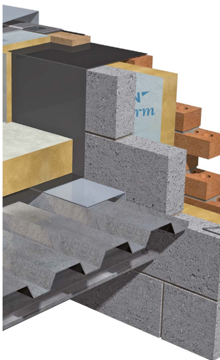
Flat roofs: QRFR-DPFR in metal deck