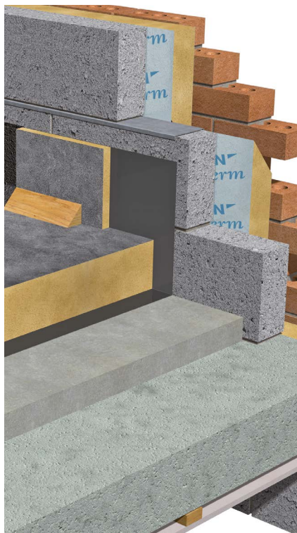
Flat roofs: QRFR-DPFR in concrete deck